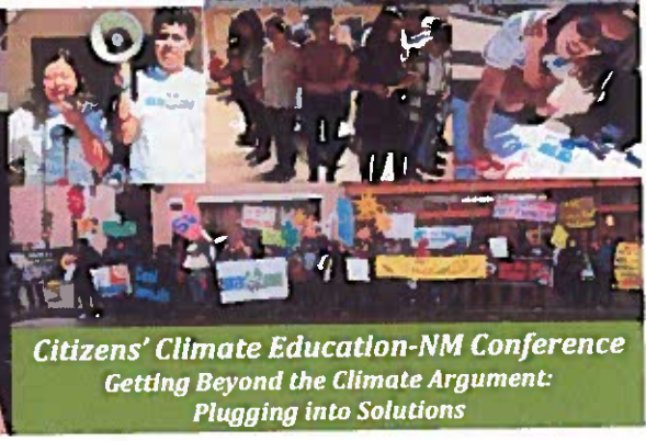
Citizens' Climate Education-NM Conference Getting Beyond the Climate Argument: Plugging into Solutions